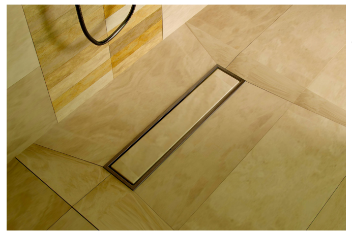
Linear drain—solid cover showing.

For specifications, please see item code DC5500-PVC.