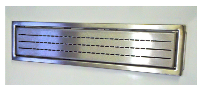
Slotted cover detail.